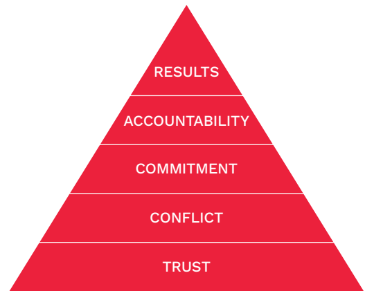
The Five Behaviors Model

The experience is completed through a half-day training session, led by a trained Five Behaviors expert. This session includes a walkthrough of the Personal Development profile, breakout activities, and group discussion.